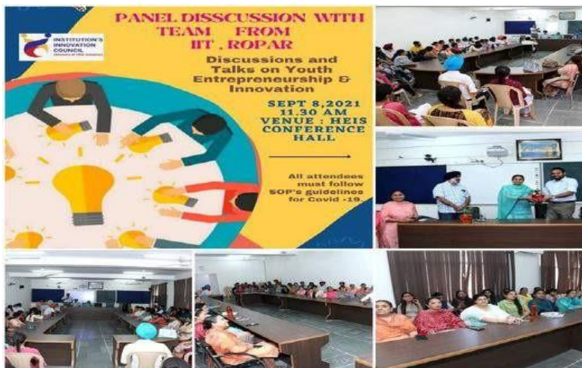
Panel Discussion with Team From IIT Ropar